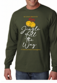
$25 Long Sleeve Cotton Shirt