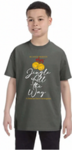
Jingle All The Way - Short Sleeve Green T-shirt